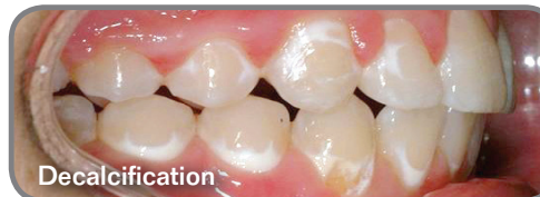
An example of decalcification resulting from improper oral hygiene during orthodontic treatment.

Decalcification causes unsightly white stains where the enamel has been irreversibly damaged due to poor oral hygiene. When acid in plaque sits on the teeth long enough, it starts leeching calcium from the enamel. Over time the enamel becomes soft due to calcium loss, and the outer layer of the tooth is permanently weakened.