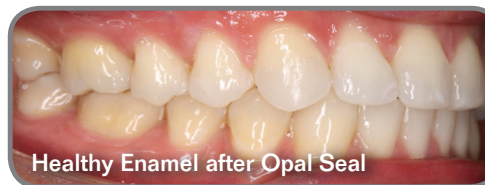
An example of healthy enamel after orthodontic treatment with Opal Seal.

Practice good oral hygiene, and Opal Seal will do its job improving your enamel health. Opal Seal creates a barrier between plaque and the enamel while delivering fluoride to the tooth surface. The combination of good oral hygiene and Opal Seal will safeguard your smile. When it's time to take your braces off, we will remove Opal Seal as well, revealing your beautiful new look!